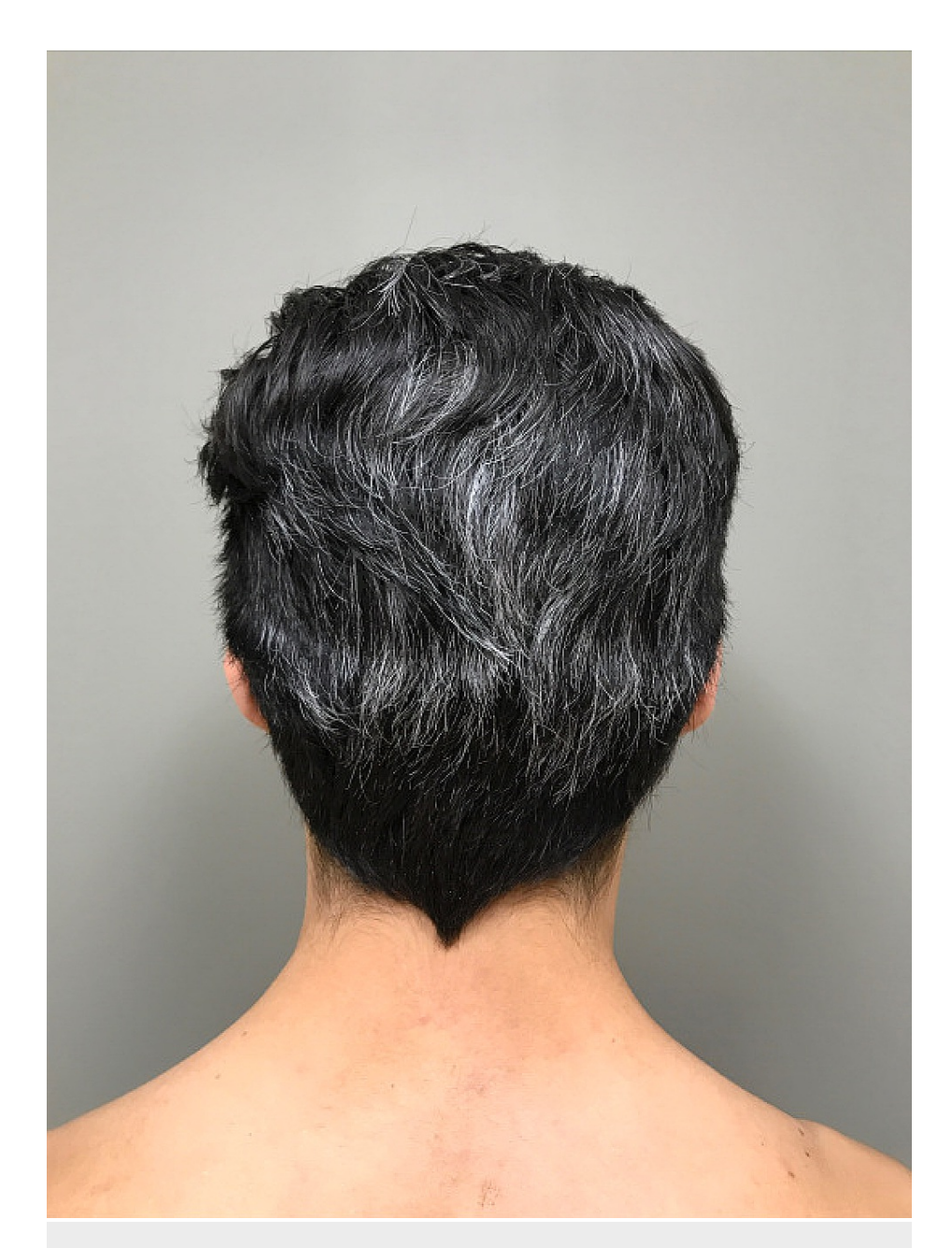
FIGURE 2: The patient's hair notable for diffuse premature graying of hair.

The patient was started on topical betamethasone dipropionate 0.05% ointment twice daily to the affected areas apart from the scalp. Gingko biloba (60 mg twice daily) and alpha-lipoic acid (100 mg once daily) capsules were also initiated. He was referred to ophthalmology and his ocular exam was unremarkable for melanoma. Thyroid-stimulating hormone was normal.