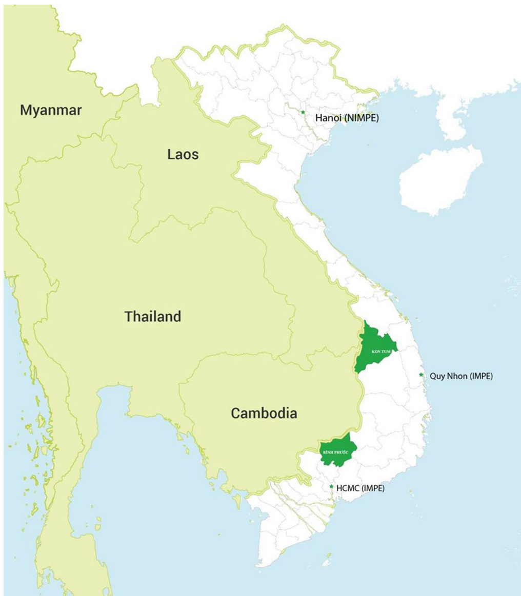
Fig. 2 Provinces of field study, qualitative studies December 2015–January 2016, Vietnam

P.f., Plasmodium falciparum ; P. v., Plasmodium vivax malaria