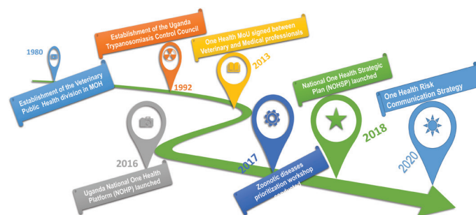
Figure 1 | One Health achievements in Uganda.