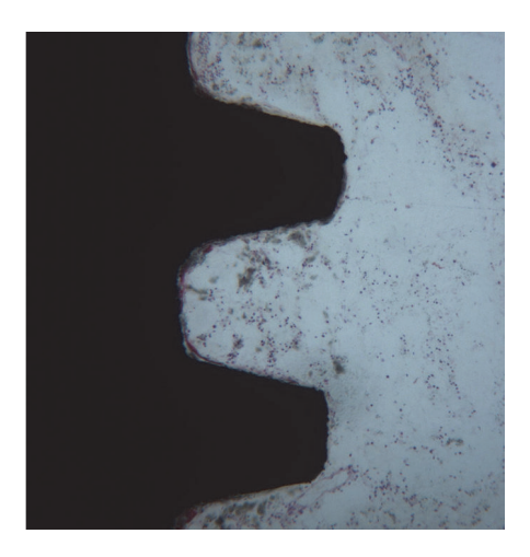
FIGURE 2: Newly trabecular bone is present in close contact with implant surface. Toluidine blue and acid fuchsin 50X.

It was possible to observe a large number of newly formed bone trabeculae that were in contact with the implant surface (Figures 4–6). A few osteoblasts were actively secreting the