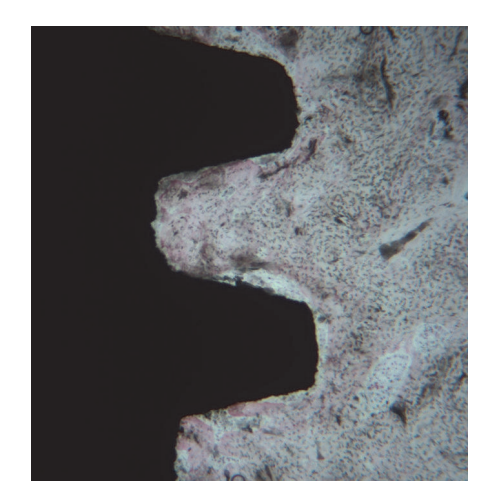
FIGURE 4: Mature bone and immature primary osteons (PO) were visible in coronal portion of implant. Toluidine blue and acid fuchsin 20X.