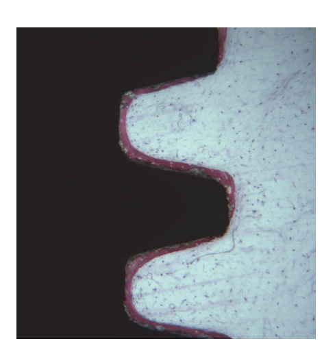
FIGURE 5: Newly trabecular bone in the contact to all implant surface. Toluidine blue and acid fuchsin 50X.