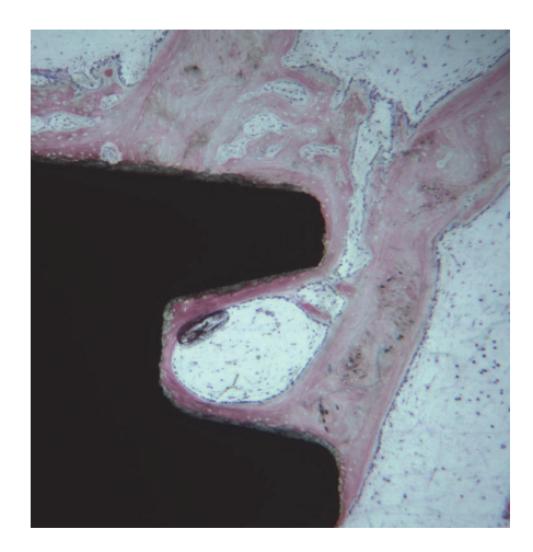
FIGURE 1: The bone formation was observed in the cortical portion of implant. Toluidine blue and acid fuchsin 20X.

level (alpha) was set at 0.05 and power at 80%. The optimal number of implants for analysis is 8 implants.