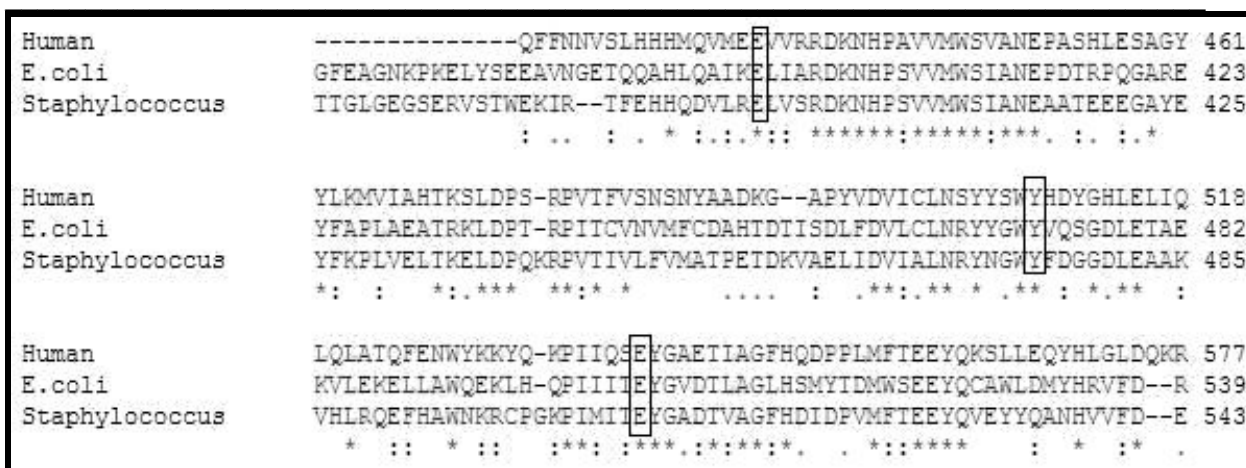
Figure 1: Multiple sequence alignment of \beta -glucuronidase from Homo sapiens , E. coli and Staphylococcus sp. RLH1 showing the conserved active site residues: Glutamic acid (E: 451, 394, 396), Tyrosine (Y: 504, 468, 471) and Glutamic acid (E: 540, 504, 508) at corresponding positions as shown in boxes. The identity shared between the \beta -glucuronidase of Homo sapiens and E. coli is 42.6% and that of Homo sapiens and Staphylococcus sp. RLH1 is 41.8%.

Analyses of the predicted models were performed to glean information for describing catalytic function. We observed that in E. coli GUS, the catalytic site residues expect for 394Glu were found in the secondary structural regions with 504Glu in the \beta strand and 468Tyr in the immediate environment of a \beta strand. However, in Staphylococcus GUS all the three catalytic site residues 396Glu, 508Glu and 471Tyr occur distinctly in the loop segments. The above has relevance to the observation we made based on the secondary structure analysis wherein there is an increased presence of coiled regions in Staphylococcus GUS. Interestingly, all the three catalytic site residues fall within the loop region of the 3D structure. The solvent accessibility of the protein