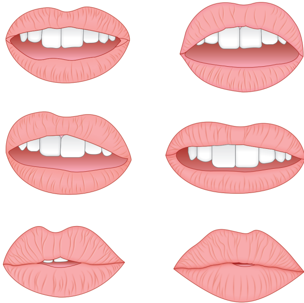
Fig. 1: Change in size and shape of oral cavity

The Diagnostic and Statistical Manual of Mental Disorders, fourth edition (American Psychiatric Association, 1994) documented two forms of specific language impairment (SLI), an expressive form and a mixed expressive-receptive form. The prevalence rate for the expressive form was estimated to be between 3% and 5% and the mixed form was 3%. Thus, the prevalence rate for both forms of SLI should be between 6% and 8% even if enough data are not available. 11 There is a scarcity in prevalence data of SLI in the Indian population. Speech and language disorders are the most commonly