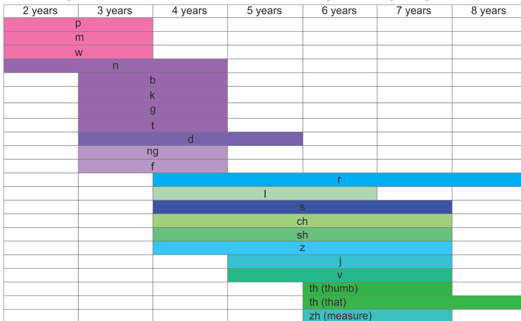
Fig. 3: Speech development chart

Below is a chart reflecting speech sound acquisition. The upper range indicates when 90% of children have learned that sound. For example, 90% of children have acquired the “n” sound by the time they are 4 years old; 90% of children have learned the “s” sound by the time they are 4 years old; 90% of children have learned the “s” sound by the time they are 7 years old.