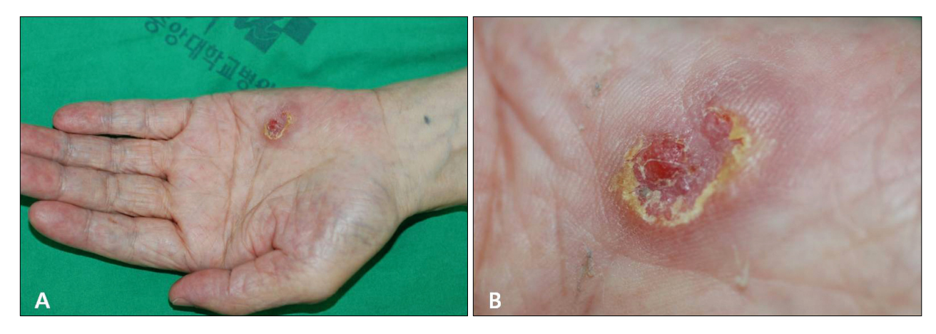
Fig. 1. (A) An erythematous, firm, well-circumscribed ulcerative plaque on the palmar aspect of the left hand. (B) The lesion was 3 \times 1.5 cm sized and appeared to be two ulcerative plaques that had coalesced into a single plaque.