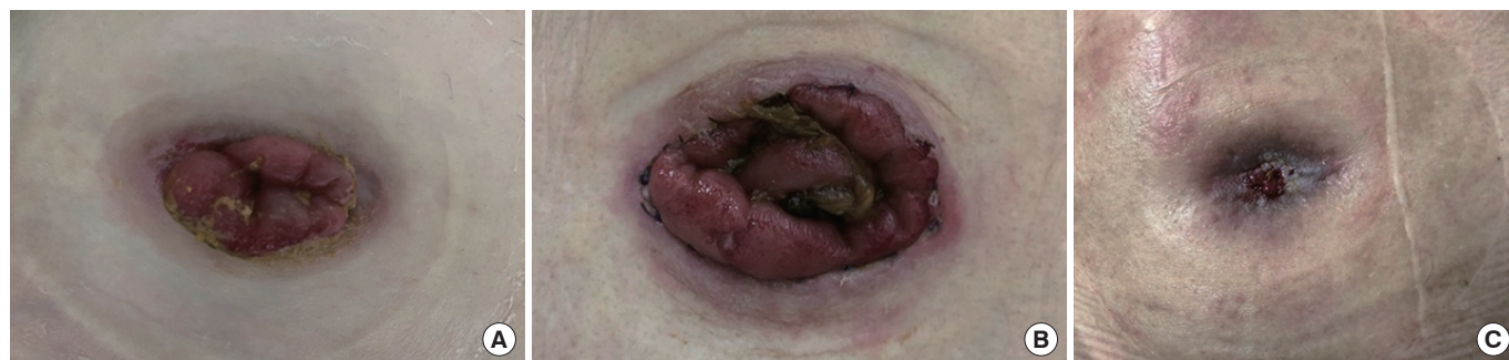
Fig. 1. (A) Photograph of a blowhole colostomy performed on the cecum. (B) Photograph of a blowhole colostomy performed on the transverse colon. This patient was operated under local anesthesia because general anesthesia was impossible due to very severe chronic obstructive pulmonary disease. (C) Photograph of a spontaneously closed blowhole colostomy on the transverse colon.

Loop type stoma was created in the ileum ( n = 16 ), transverse colon ( n = 7 ), or sigmoid colon ( n = 12 ). After careful review of