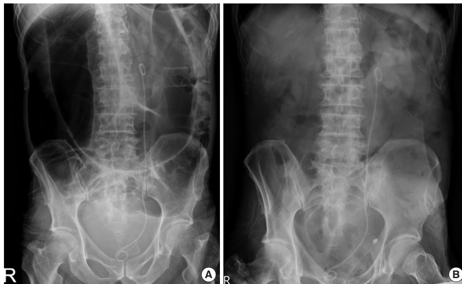
Fig. 2. (A) Abdominal X-ray before surgical intervention. (B) Abdominal X-ray after blowhole colostomy on the transverse colon at postoperative day 1.

the abdominopelvic CT images, an upper abdominal incision was extended down to the fascia at the location of maximal transverse colon dilation for transverse colostomy. If the sigmoid colon and ileum were involved, a lower abdominal incision was made in the rectus abdominis muscle. The bowel was delivered through the abdominal wall. The previously placed suture or mark in the distal segment was used to confirm that the bowel was viable and had not twisted. An ostomy rod was placed through the mesentery in standard fashion before maturation of the ostomy via standard means, and then an appropriate stoma bag was attached.