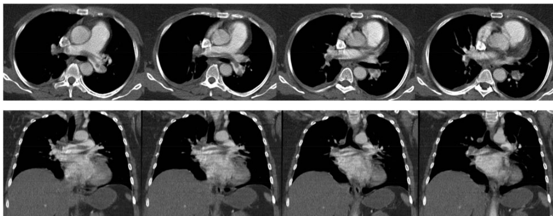
Fig. 3. Central PE in an obese patient. Normal dose CT protocol was used (axial and coronal view).

reconstruction algorithms in a selected patient cohort (body weight <80 kg) (19). A CTDI_{vol} of 2.3 \pm 0.8 mGy was reported, which is a good value in CT imaging of the pulmonary vascular system. However, comparing this study to our data is challenging because no iterative reconstruction algorithms were used and tube-detector systems made substantial improvements over the past decade.