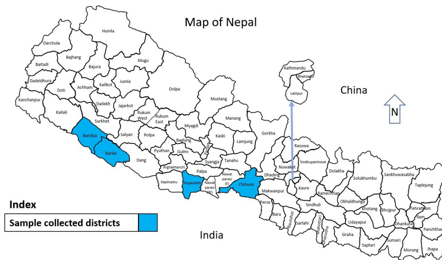
FIGURE 2 Map of Nepal with sample collected districts