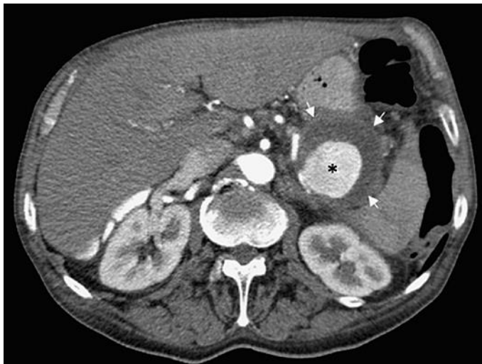
Fig. 2. Contrast-enhanced CT scan showing a pancreatic pseudocyst with a maximum diameter of 70 mm (arrows). Inside the pseudocyst is a pseudoaneurysm originating from the splenic artery with a maximum diameter of 41 mm (asterisk).