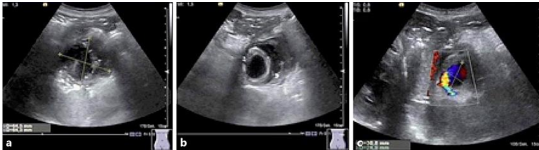
Fig. 1. a, b Transabdominal ultrasound showing a pancreatic pseudocyst with a maximum diameter of 65 mm and an inhomogeneous echo of the cystic content. c Color-coded Doppler sonography showed a turbulent blood flow in parts of the cyst.