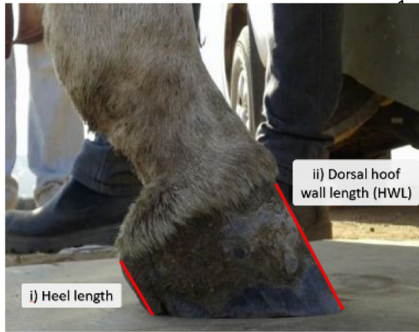
Fig. 1. Photograph of the right hind limb of a donkey. The red lines indicate how the i) heel length and ii) dorsal hoof wall length (HWL) were measured.