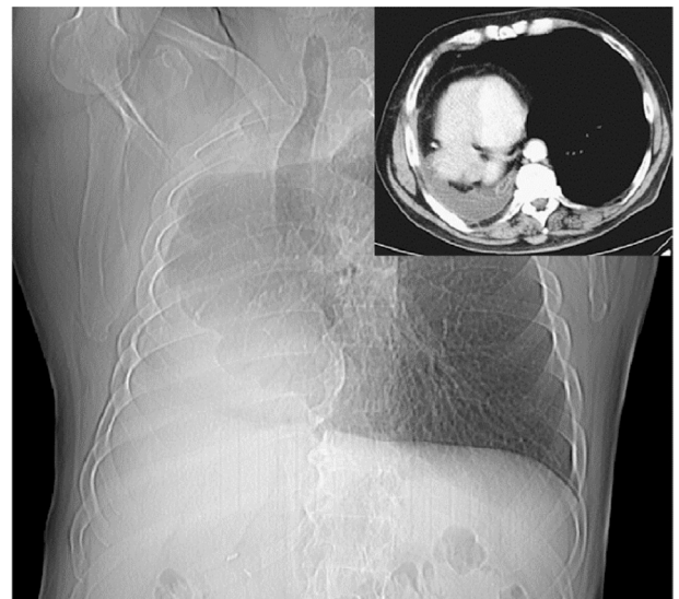
Fig. 3. CT topogram and axial view (inlay) show the heart displaced to the right hemithorax.

This false diagnosis (SVT treated as VT) is always less life