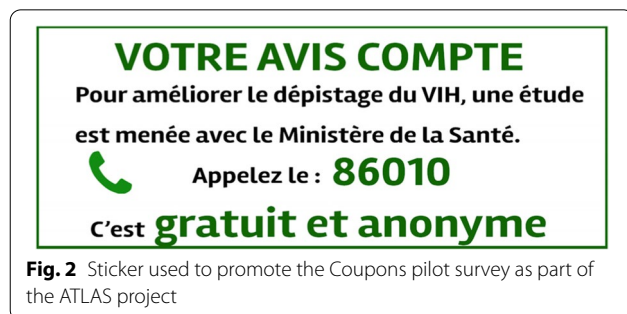
Fig. 2 Sticker used to promote the Coupons pilot survey as part of the ATLAS project

However, at the end of March 2020, a few days after COVID-19 was declared to be a global pandemic, survey participation decreased considerably and remained relatively low until the end of the pilot study. The COVID-19 pandemic forced the operational team to adapt their activities by entirely interrupting or reducing outreach activities, which drastically reduced the number of HIVST kits distributed and, concomitantly, severely limited the number sticker invitations in circulation.