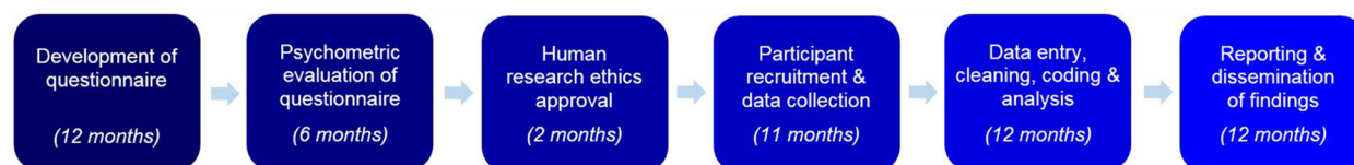
Figure 1 Flow chart of the Regional South Australia Health survey.