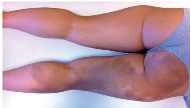
Figure 1. A typical café-au-lait lesion on the right buttock and thigh which demonstrates jagged “coast of Maine” borders and the tendency to respect the midline

MAS was originally described by McCune and Albright in 1936 (5) and 1937 (6) as the association of polyostotic FD, café-au-lait skin pigmentation and precocious puberty. It was later recognized that oth-