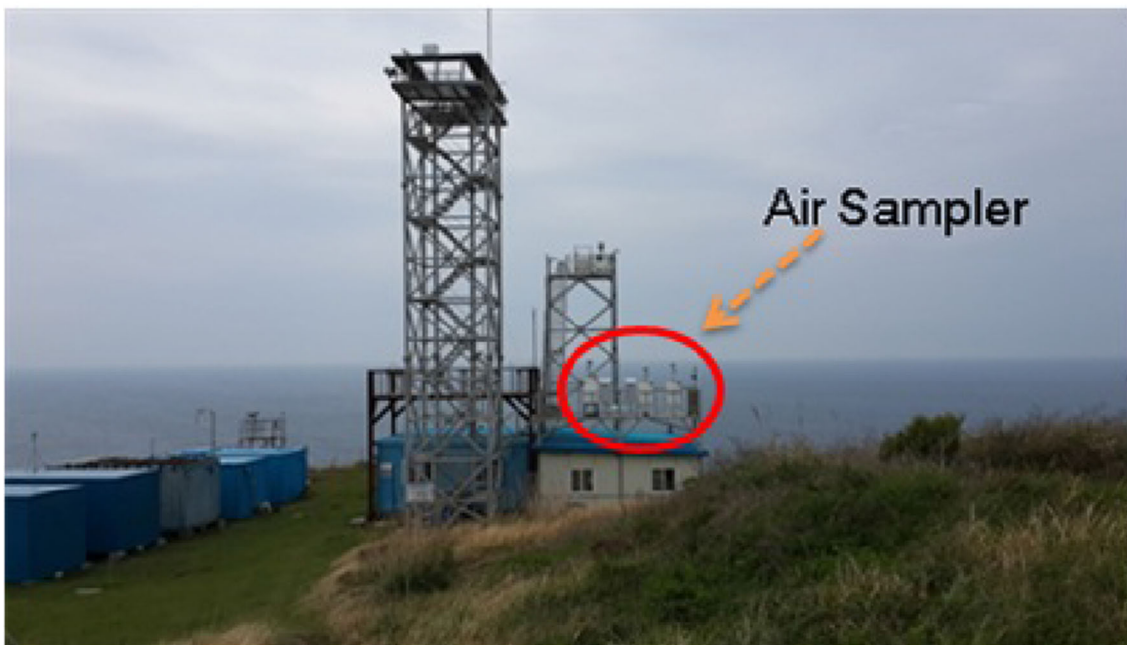
Fig. 1 Location of air sampling Gosan site in Jeju Island, Korea