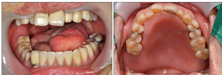
Fig. 3. A palatal augmentation prosthesis was made to improve the pronunciation of patient.

was gradually becoming similar to adjacent tissues (Fig. 1). In addition, a palatal augmentation prosthesis (Fig. 3) was made to improve the pronunciation of patient. After wearing the prosthesis, the patient's pronunciation noticeably improved.