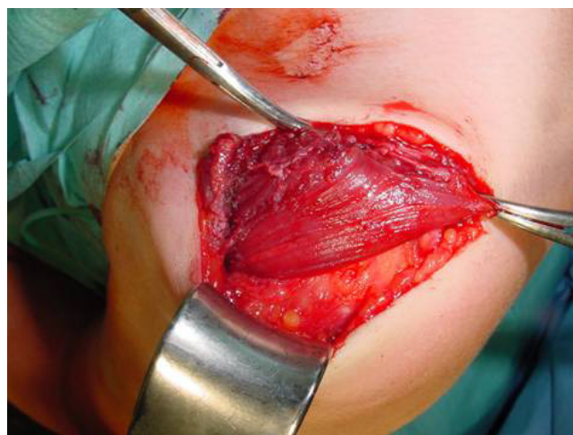
Figure 3 The muscle is positioned to replace/augment the anterior and lateral part of the deltoid muscle.

The midaxillar incision is closed over a little drain; the muscle is inserted unto the lateral clavicular rim unto the remaining dm with the arm positioned in 90° abduction and 20° flexion. This fixation is realized by several Maxon 2/0 sutures passed behind the rim suture on the tmm, so that a tight connection to the dm insertion unto the clavicle might be obtained.