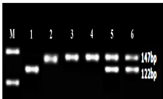
Figure 2. The enzyme digestion pattern of rs2910164. M is 50-bp size marker; Lane 1 is wild-type homozygous alleles (C/C); Lane 2, 3 and 4 are mutant type homozygous alleles (G/G); Lane 5 and 6 are heterozygous alleles (C/G).