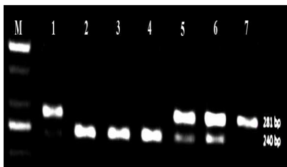
Figure 1. The enzyme digestion pattern of rs28362491. M is 50-bp size marker; Lane 5 and 6 are heterozygous ins/del ATTG; Lane 2, 3 and 4 are homozygous ins/ins ATTG; Lane 1 and 7 are del/del ATTG homozygous.