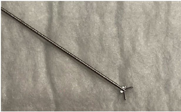
Figure 1 Micro Bite: MTW Endoskopie Manufaktur.

Several case-reports and observational studies 9–19 have been published. However, these studies were affected by a high heterogeneity and by the small number of included patients that have limited the possibility to assess the real clinical impact.