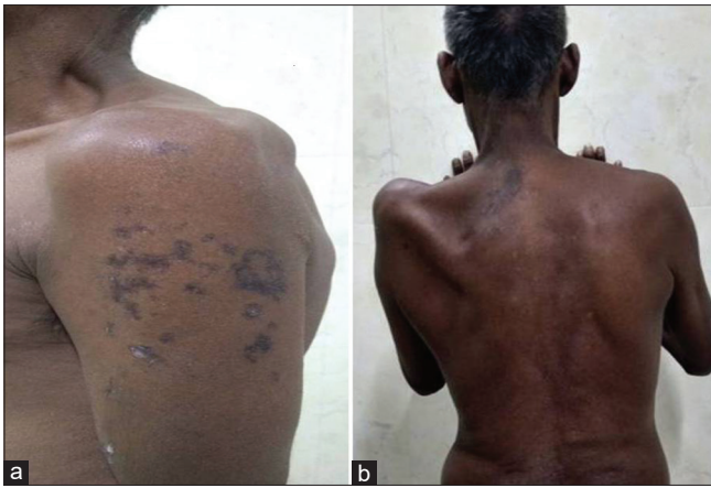
Figure 1: (a) The arm demonstrated typical zoster rash in dermatomal distribution (C5 over the regiment badge area). (b) The shoulder region revealed atrophy of left deltoid, supraspinatus, and infraspinatus muscles

of left upper limb. The pain was radiating in nature. It was followed 4 days later by vesicular eruptions over the same area [Figure 1a]. Pain increased during these eruptions. The eruptions subsided 7 days later, but pain persisted. After the vesicles subsided, he noticed that he was unable to lift the upper limb. His weakness progressed over a week and then became static. There were marks of healed eruptions over the left limb. The patient was staying away from his family for the past many years due to occupation. He reported no clear occupational injury to explain his symptoms.