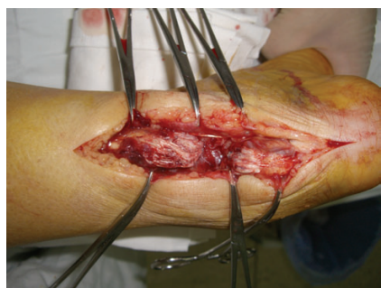
Figure 2. Macroscopic findings during the operation. The Achilles tendon was ruptured at the midportion. There were definite degenerative changes.