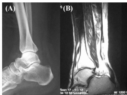
Figure 1. (A) Lateral radiograph demonstrating a negative Kager's sign. There is no abnormality in the bone and joint construction. (B) Magnetic resonance image showing a common tear of the Achilles tendon.