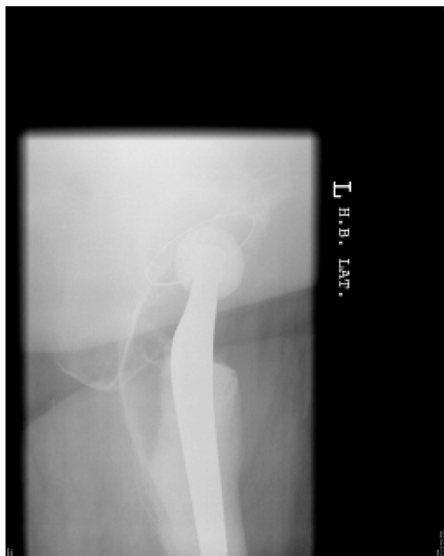
Figure 2 Lateral view of the relocated hip arthroplasty.

was an unguarded flexion of the hip. An abduction brace was prescribed but she could not tolerate wearing it all the time. She suggested having a simple device strapped to her thigh which would physically remind her when she should not flex beyond a limit.