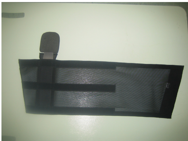
Figure 3 The orthosis (called a 'flexion reminder device') has a simple padded plastic device within an elastic strap with a Velcro fastening.

multifactorial, the three main causes for recurrent dislocation are component malposition, soft-tissue deficiency and positional reasons [3]. Component malposition, when identified, can be effectively corrected with revision of the malpositioned component [3,5]. Soft tissue imbalance can be effectively treated with trochanteric transplantation, adjusting the neck length or with constrained acetabular liners [3,5,6]. However, revision surgery is challenging and problems related to further dislocations, premature wear, increased radiolucency, fractures and dislodgement of the liners remain major concerns [7,8].