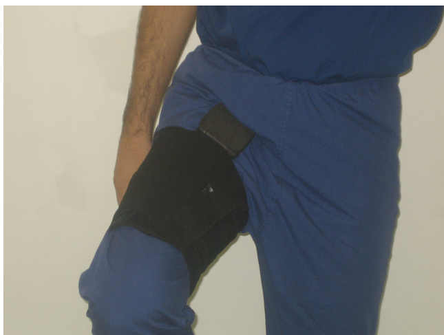
Figure 4 The padded portion of the device hitches against the groin when the hip is flexed beyond 70° and acts as a reminder.

multifactorial, the three main causes for recurrent dislocation are component malposition, soft-tissue deficiency and positional reasons [3]. Component malposition, when identified, can be effectively corrected with revision of the malpositioned component [3,5]. Soft tissue imbalance can be effectively treated with trochanteric transplantation, adjusting the neck length or with constrained acetabular liners [3,5,6]. However, revision surgery is challenging and problems related to further dislocations, premature wear, increased radiolucency, fractures and dislodgement of the liners remain major concerns [7,8].