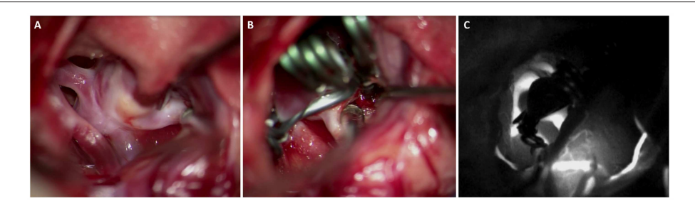
FIGURE 2 | Middle cerebral artery aneurysm with the neck dissected and clear view of the parent vessel, and its two branches (A), after retraction showing the neck of the clipped MCA aneurysm (B), and intraoperative ICG videoangiography showing the patency of the branches of the MCA and complete exclusion of the aneurysm from the circulation (C).

by Raabe et al. (21) and implemented by Carl Zeiss Co. (Oberkochen, Germany). Given that its fluorescent wavelength is in the near-infrared (NIR) spectrum (700-2,500 nm), the dye cannot be seen by the naked eye, and a NIR imaging device must be available to allow vessel visualization. A simple ICG device consists of a NIR light source, an NIR sensitive sensor, and filters used to block light at other wavelengths (3, 21). This allows users to obtain high-resolution NIR images without ambient and excitation light interference. A light source illuminating the operative field has a wavelength comprising the ICG absorption band (range 700-850 nm, peak 805 nm). The setup entails a uniquely designed dielectric filter that allows passage of light in the NIR wavelength that fits the exact absorption band of ICG. An integrated beam splitter in the microscope directs the ICG fluorescence light (range 780-950 nm, peak 835 nm) toward a black-and-white camera, with an observation band-pass filter being used to detect the ICG fluorescence (21).