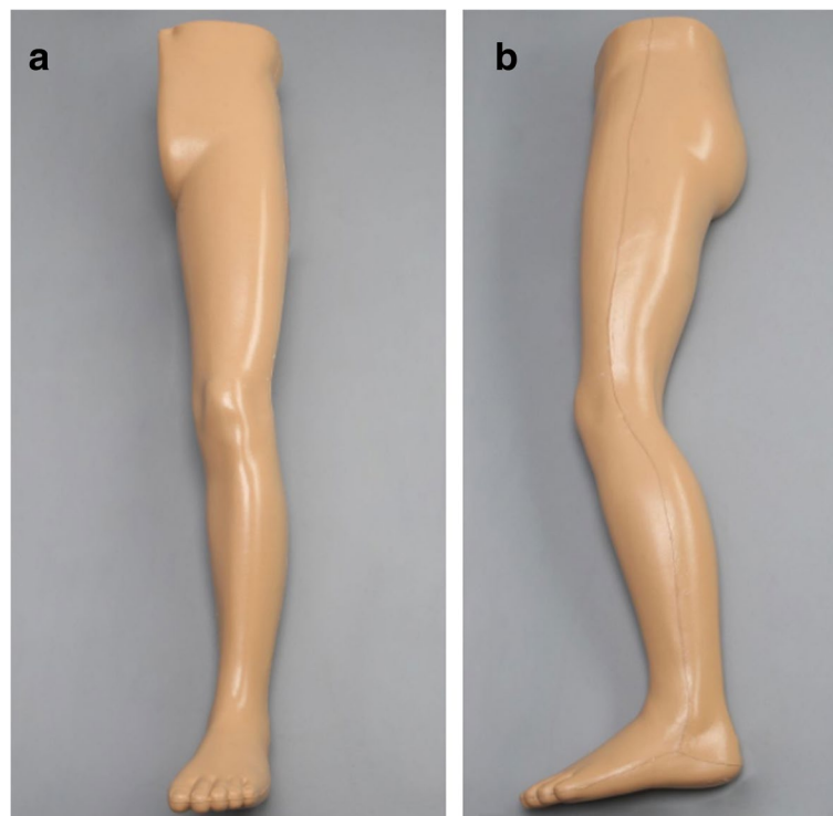
Fig. 1 Fully soft tissue encased sawbones

This study applies a methodological framework to compare biplanar and uniplanar imaging for the times needed to conduct key steps while performing intramedullary nailing. We used intramedullary nailing of the femur (Proximal Femoral Nail Antirotation, PFNA, DePuy Synthes, Oberdorf, Switzerland) and tibia (Expert Tibial Nail, DePuy Synthes, Oberdorf, Switzerland) on fully soft tissue encased legs with radiopaque sawbones (SKU:1515–7-11, Sawbones Europe, Malmö, Sweden) (Fig. 1). Biplanar imaging was done with a preassembled device (Biplanar™ 600 s, Swemac Imaging, Swemac Medical Imaging Devices, Täby, Sweden) containing two perpendicular independent image sources