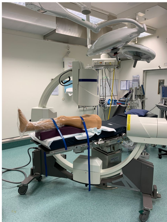
Fig. 5 Securely positioned sawbone with biplanar imaging device

optimal EP (in the middle of the intercondylar notch, aligned with the axis of the intramedullary tibial canal and on the anterior edge of the proximal tibia) for the Expert Tibial Nail using a suprapatellar approach and time elapsed from skin incision to bicortical drilling through the nail in preparation for one DL screw (static). We used three sawbones and performed the distal drilling at different levels by adjusting the nail position to achieve an untouched area. DL was performed with the uniplanar imaging in the lateral position and time measurement was initiated once an optimal image had been obtained. The image intensifiers were controlled by foot control by the orthopaedic surgeon. Repositioning of uniplanar imaging was done by an assistant theatre nurse. The number of performed swings of the uniplanar imaging and the number of missed drillings (anterior or posterior to nail) for DL were noted. Accurate positioning was determined by fellow orthopaedic surgeons.