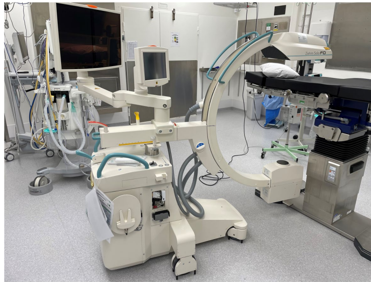
Fig. 4 Uniplanar imaging (Ziehm Solo FD, Ziehm Imaging) used in the study

through a long PFNA femoral nail, time from skin incision to guidewire positioning at the optimal EP (aligned with the intramedullary femoral canal and in extension with Blumensaat's line) for the retrograde femoral nail, time from skin incision to guidewire positioning at the