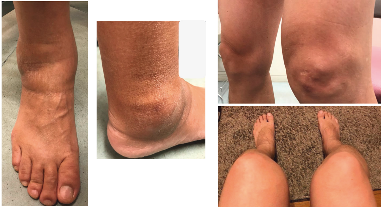
FIGURE 1: Case presentation. The patient presented with inflamed joints of the left ankle and right knee when he was referred to our hospital.