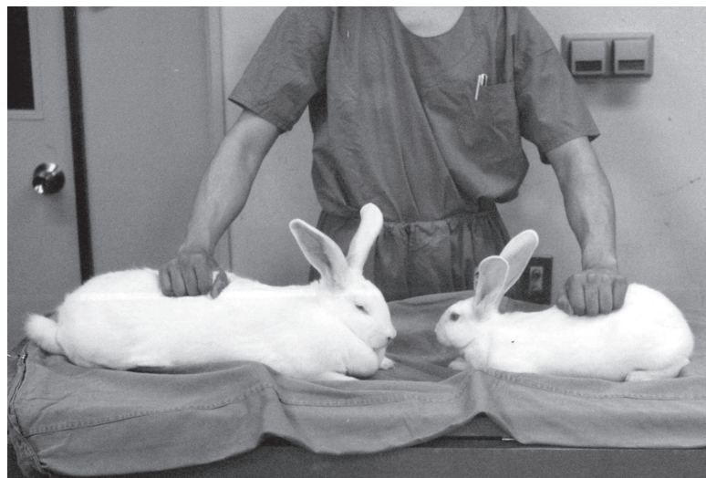
Fig. 1. Comparison of body size of JW-AKT (left) and JW (right) rabbit.

not controlled. As a result, Akita Kairyō rabbits often exhibit infectious diseases like snuffles which can interfere with the results of experiments. Thus we have established a specific pathogen free (SPF) colony of Akita Kairyō rabbits housed in microbiologically controlled facilities for animal experiments, and named JW-AKT [20].