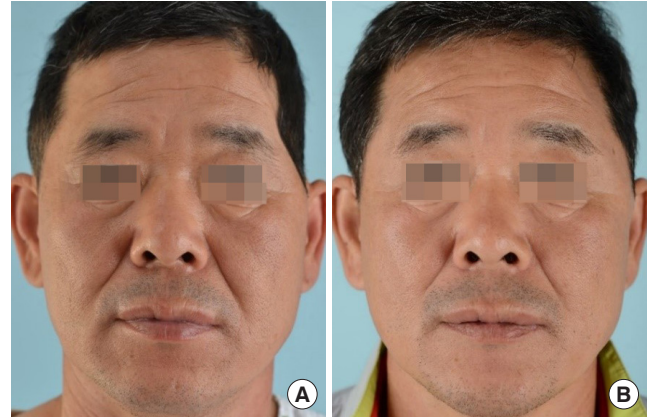
Fig. 3. A 51-year-old man with a postoperative depression deformity on the temple. The left side was corrected by silicone implant insertion. (A) Preoperative and (B) 4-month postoperative photographs.

Autologous reconstruction has long been considered the best reconstruction method due to its excellent osteoconductive properties; however, inadequate donor site mobility and an insufficient extent of tissue harvesting are limitations of this technique. Therefore, other methods, such as bone allografts, bone morphogenetic proteins, and synthetic graft materials, are often used as alternatives. Morphogen-enhanced bone graft substitutes have shown similar success rates and equivalent quality of regeneration, but their price remains relatively high [10]. In 2020, Choi et al. [11] introduced a method of reconstruction using dermofat grafts from the groin to correct acquired facial deformities. However, the groin, as a donor site, does not yield a sufficient amount of tissue for large temporal hollowing deformities. In recent years, alloplastic reconstruction has been widely used as a technique with proven biocompatibility that overcomes the shortcomings of autologous reconstruction. Titanium is the oldest alloplastic material. Its biocompatibility has been extensively demonstrated [12], and it has high mechanical strength and therefore excellent stability; however, further intraoperative adaptation of a titanium implant is extremely difficult. Other alloplastic materials such as glass-ceramics, polymethyl-methacrylate [13], hydroxylapatite [14], and polyetheretherketone can be used [5], but their disadvantages include the possibility of infection, breakage, and thermal damage