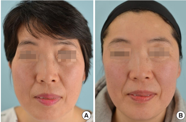
Fig. 2. A 48-year-old woman with a postoperative depression deformity on the temple received correction with bilateral silicone implant insertion. (A) Preoperative and (B) 9-month postoperative photographs.