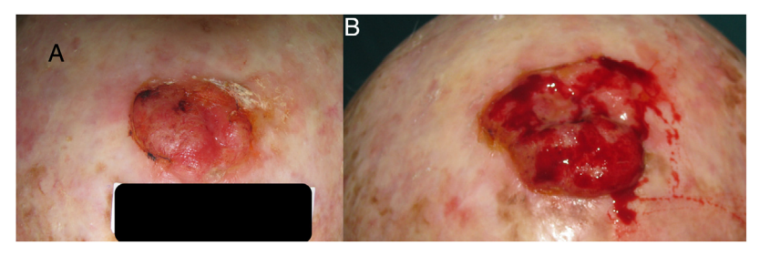
Figure 2 Squamous cell carcinoma of the scalp that grew from 25 mm to 42 mm over 3 months.