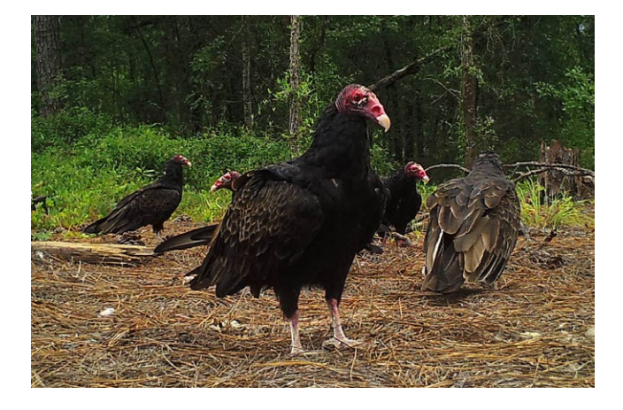
FIGURE 1 Turkey vultures ( Cathartes aura ) scavenging a rabbit carcass at the Savannah River Site, Aiken, SC

We conducted this study at the Savannah River Site, a property owned by the US Department of Energy that encompasses 78,000 ha in Aiken County, South Carolina, USA (33°19'N, 81°42'W). The site is dominated by loblolly pine forests ( Pinus taeda ), longleaf pine forests ( Pinus palustris ), and bottomland hardwoods (e.g., Nyssa spp., Quercus spp.) (White & Gaines, 2000). Since 1951, much of the site has been managed for timber harvest and stands are harvested on a rotating basis (White & Gaines, 2000). We conducted this study during June– August 2016; average daily temperature was 27.6°C and average daily rainfall was 0.33 cm (NOAA 2017).