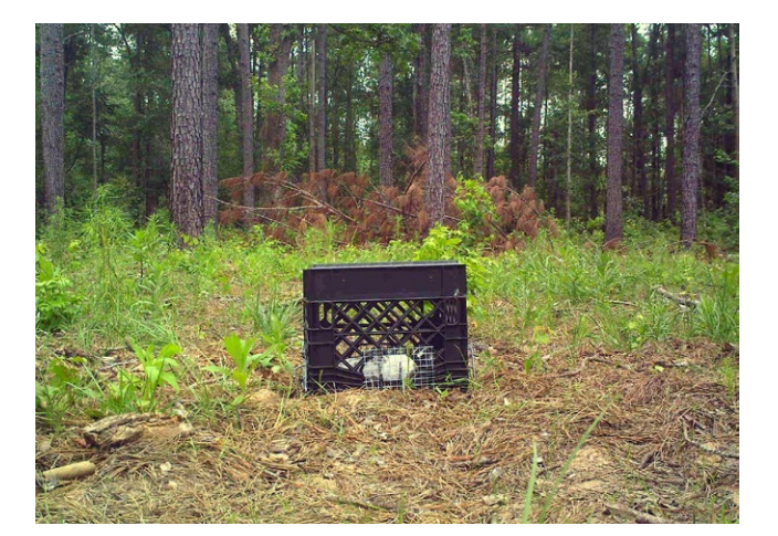
FIGURE 2 Placement of plastic crate (33.0 cm long, 33.0 cm wide, 27.6 cm tall) with panels of wire affixed over the handle openings over rabbit carcass to exclude diurnal scavenging. Logs were also placed along the perimeter to prevent vultures from reaching their bills under the edge of the crate and pulling out the carcass

control carcasses by these species were rare, consisting of one visit each by an American crow ( Corvus brachyrhynchos ) and a red-tailed hawk ( Buteo jamaicensis ) (see Results). In both cases, the bird was displaced by a vulture that consumed the majority of the carcass and scavenging by these species likely had a negligible impact on carcass consumption. We removed these species from our analysis because they could not access the exclusion carcasses, but maintained these two trials in analysis. We visited control carcasses twice daily to standardize human presence between the treatment and control trials. For each carcass, we documented the date when there appeared to be no edible flesh remaining on the carcass and considered the carcass fully scavenged at that time.