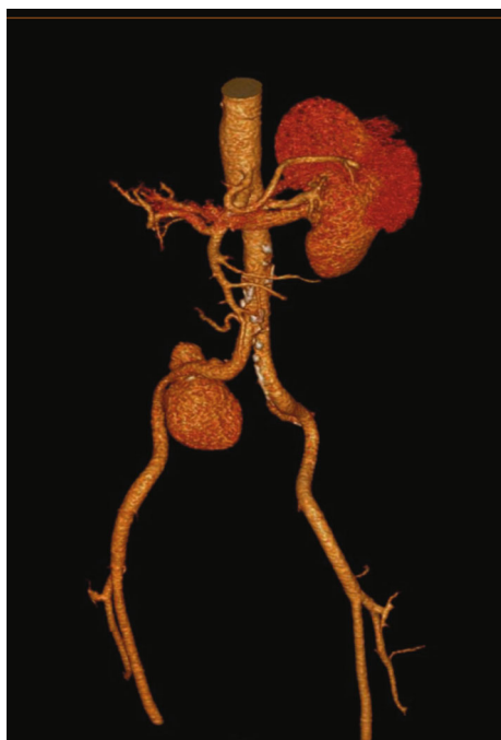
FIGURE 2: Multiplanar reformatted images show right internal iliac artery aneurysm just past the iliac bifurcation.

mortality rate [9]. The mean diameter of the aneurysm at the time of rupture is almost 7 cm delaying operative treatment until a diameter of 4 cm may be safe.