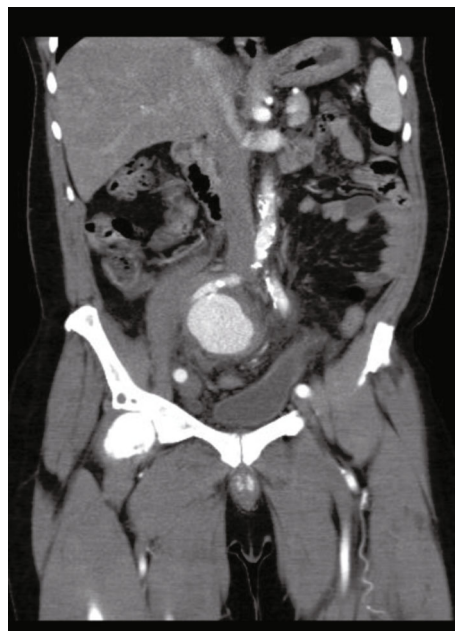
FIGURE 3: Contrast-enhanced CT scan of the abdomen and pelvis, with coronal images showing a large contrast-filled structure in keeping with iliac artery aneurysm compressing and pushing the urinary bladder laterally.

Helical computed angiography is the gold standard, showing the site, size, tortuosity, path, relationship with adjacent organs, signs of rupture, and retroperitoneal hemorrhage [4, 6, 11].