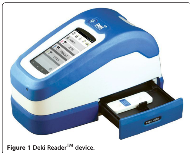
Figure 1 Deki Reader™ device.

Molecular analysis involved extraction of parasite DNA from dried blood spots on filter papers. The DNA