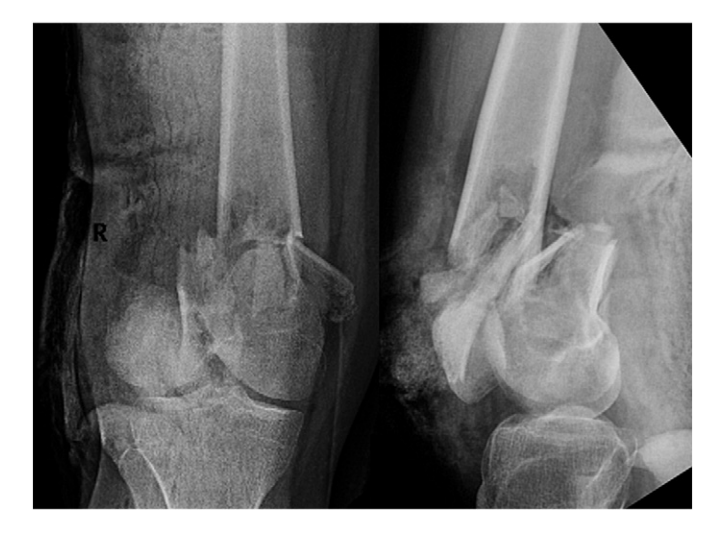
Fig. 2. Radiographs at presentation.

Reimplantation of extruded bone is a risky procedure and in all techniques described previously in the literature, attempts at disinfecting the bone fragments led to a compromise in biology [4,7,8]. Bauer et al.