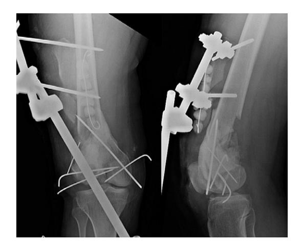
Fig. 5. Post-operative radiographs after initial surgery.

Fig. 4. Intra-operative image after debridement and placement of antibiotic cement spacer in the defect. The free bone fragments were inserted at the proximal end of the incision along with a few antibiotic cement beads.