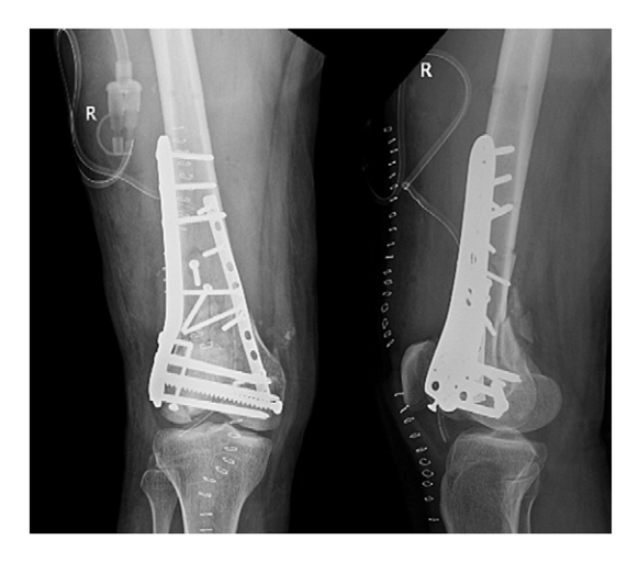
Fig. 6. Post-operative radiographs after second surgery where definitive fixation has been done after placing bone fragments at their anatomical location.