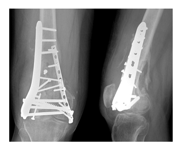
Fig. 7. Radiographs at follow-up of 6 months showing good consolidation.

Extruded bone fragments can be successfully reimplanted to aid in the restoration of leg length and alignment, and preservation of optimum function. But striking the balance between maintaining cell viability and