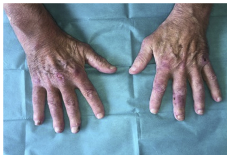
Fig 1. Acrocyanosis, painful erythematous and violaceous papules on the back of hands and fingers and necrotic paronychia.

intravenous corticotherapy (1 mg/kg/d) and immunoglobulin perfusions (2 g/kg every 4 weeks) were started. We did not diagnose Buerger disease based on the clinical presentation and the positivity of anti-MDA-5 antibodies. Hydroxychloroquine was added 1 month later, because he was refractory to standard immunosuppressive treatment with extension of cutaneous necrotic features (Fig 3).