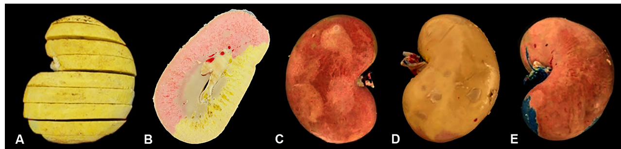
Figure 1 - Ovine kidney prepared for proportional volume analysis of each segment. At image A, after resin injection of different colors into each segmental artery, the kidney was sectioned in 0.5-thick slices. At image B it is noted the surface of one transverse section, with the region irrigated by ventral (red) segmental artery and dorsal (yellow) segmental artery. Ventral (C) and dorsal (D) faces of two-segment ovine kidney, and ventral face of three-segment ovine kidney (E) after resin injection of different colors into each segmental artery.

Regarding the arterial segments of the 18 studied kidneys, 88.8% (16 kidneys) presented a division of renal artery into two segmental arteries. One destined to the ventral (anterior) region, and other for the dorsal (posterior) region. In 11.2% (two kidneys) there was three segmental ar-