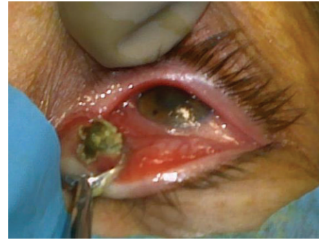
FIGURE 1: The incision perpendicularly revealed the content of the abscess.

Apart from canaliculitis Actinomyces is documented to cause various ophthalmic infections, such as blepharitis, conjunctivitis, keratitis, dacryocystitis, and postoperative