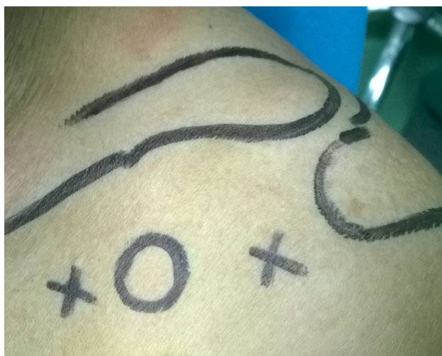
Fig. 1 Arthroscopic portals: one was placed medial to the tip of the coracoid process and another was placed laterally or slightly inferior to the tip of the coracoid process

The surgery was performed on patients in a “beach chair” position under general anesthesia. Intraoperative systolic pressure was maintained at approximately 100 mmHg. Arthroscopic lavage fluid contained 1:100,000–1:300,000 epinephrine hydrochloride. The position of the lavage fluid was 80–100 cm above the surgical site. The positions of the clavicle, acromion, and coracoid process were marked