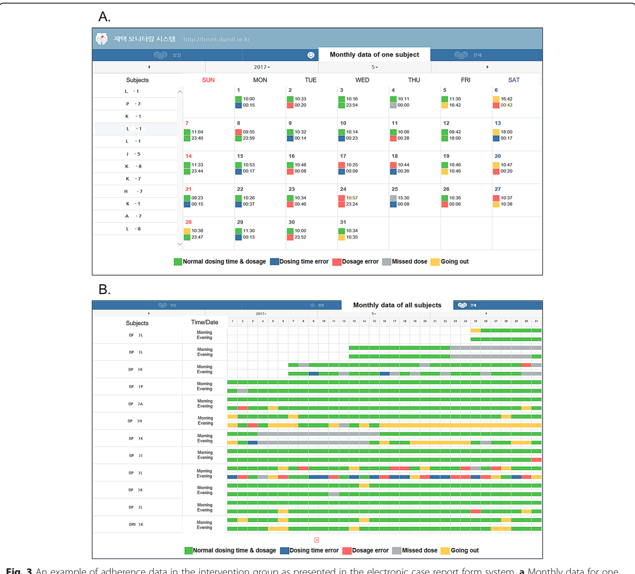
Fig. 3 An example of adherence data in the intervention group as presented in the electronic case report form system. a Monthly data for one subject. b Monthly data for all subjects

Table 5 shows the patients' satisfaction with the ICT-based clinical trial system. The overall satisfaction with the system was above the median score, and significantly increased across the study period. The patients gave generally positive assessments of the system's convenience, safety, and accuracy, and generally responded positively to the idea of using the system to participate in future clinical trials.