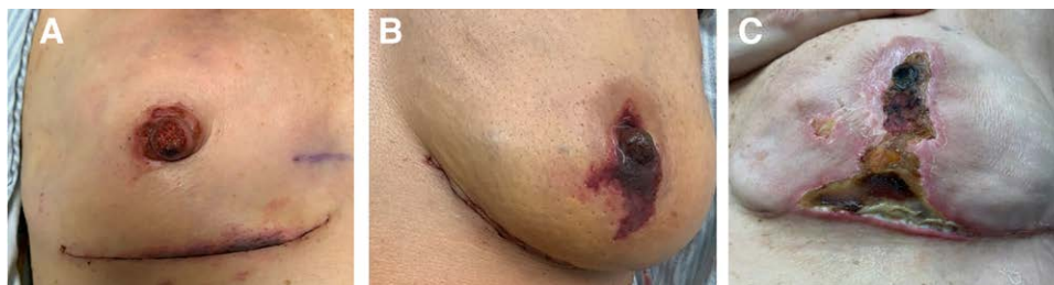
Fig. 1. Examples of varying degrees of NAC and mastectomy flap necrosis in patients with IMF incisions. A, IMF incision with superficial epidermolysis of NAC and marginal epidermolysis of the mastectomy skin flap at IMF. B, IMF incision with partial thickness necrosis of the NAC extending onto inferior mastectomy skin flap. C, IMF incision with full-thickness tissue loss and eschar involving both NAC and large portion of inferior mastectomy skin flap.

Statistical analysis was performed using IBM SPSS v23.0 (Armonk, N.Y.) and included the use of the Fisher exact test for categorical variables and the Mann-Whitney U test for continuous variables. Cases were analyzed on a per reconstructed breast basis rather than per patient basis, which simplifies analysis due to the fact that bilateral reconstructions double the risk of complications. To control for interactions among the predictors of complications that exist in our study beyond incision type, a multivariable binary logistic regression was performed. This was done for the outcome of any nipple necrosis by including all predictor variables in our regression model and performing backward elimination of variables with a significance cutoff of 0.05 and using the likelihood ratio as a goodness of fit statistic until the parsimonious model was achieved. A value of P less than 0.05 was used to