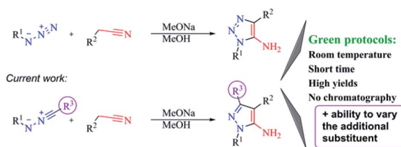
Scheme 1 Overview of the developed green protocols giving libraries of amino-functionalized azole derivatives.