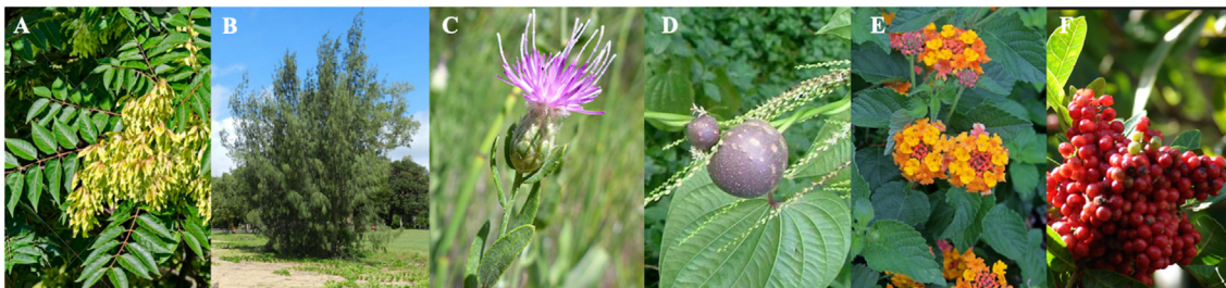
Fig. 1. Photographs of plant species analyzed in this study: (A) Ailanthus altissima , (B) Casuarina equisetifolia , (C) Centaurea stoebe ssp. micranthos , (D) Dioscorea bulbifera , (E) Lantana camara , and (F) Schinus terebinthifolia .

climate of North America under the rcp4.5 model in the year 2050) onto for downstream analyses and identify regions where extrapolation may occur for predicting areas of suitable climate, thus reducing the reliability of the predictions.