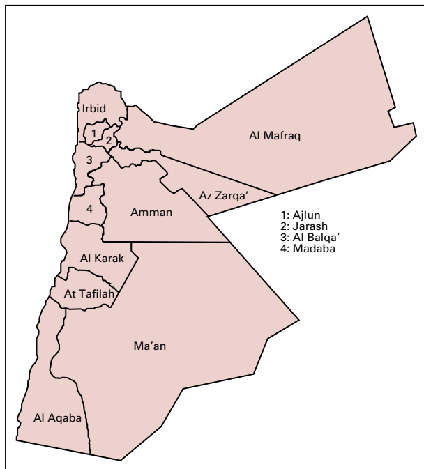
FIG 2. Jordan map showing governorates.

Brachytherapy is a form of RT for small and deep tumors. 10 It involves inserting a device into a body cavity (intracavitary brachytherapy) or into a lumen (intraluminal brachytherapy) or directly into body tissues (interstitial brachytherapy). Currently, KHCC is the only center that provides brachytherapy. KHCC provides intracavitary HDR brachytherapy for gynecologic and nasopharyngeal malignancies, and low-dose rate (LDR) brachytherapy for tumors of the eye. Recently, a new brachytherapy system was installed at Queen Alia Hospital (RMS).