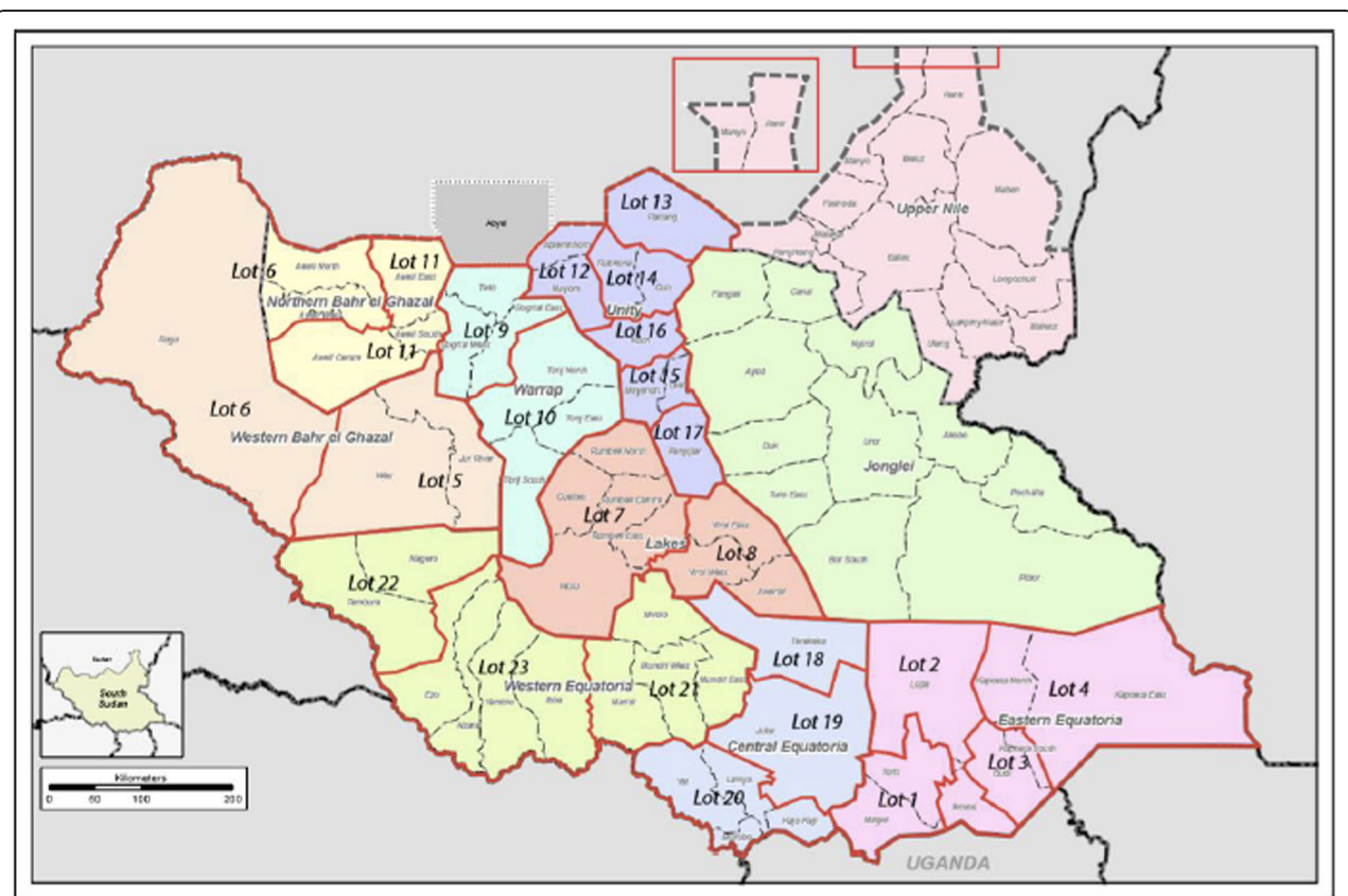
Fig. 2 Health pool fund geographic distribution by lot, South Sudan (2018)