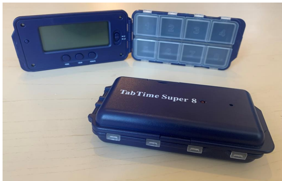
Figure 1. TABTIME ® Super 8.

For the purposes of this study, we used pillbox organizers with alarms—TABTIME ® Super 8 (TabTime Ltd., Moss Ln, Sandbach, UK) (size 12 × 6 × 3 cm, Figure 1). This tool has eight tablet compartments and up to eight daily alarms (audio and visual) set to specifically required times. An audio alarm rings for 30 s, and a visual LED reminder light continues to flash until the pillbox is opened. All participants of the study were trained in the use of the pillbox organizers with alarms, and times of doses were set by investigators.