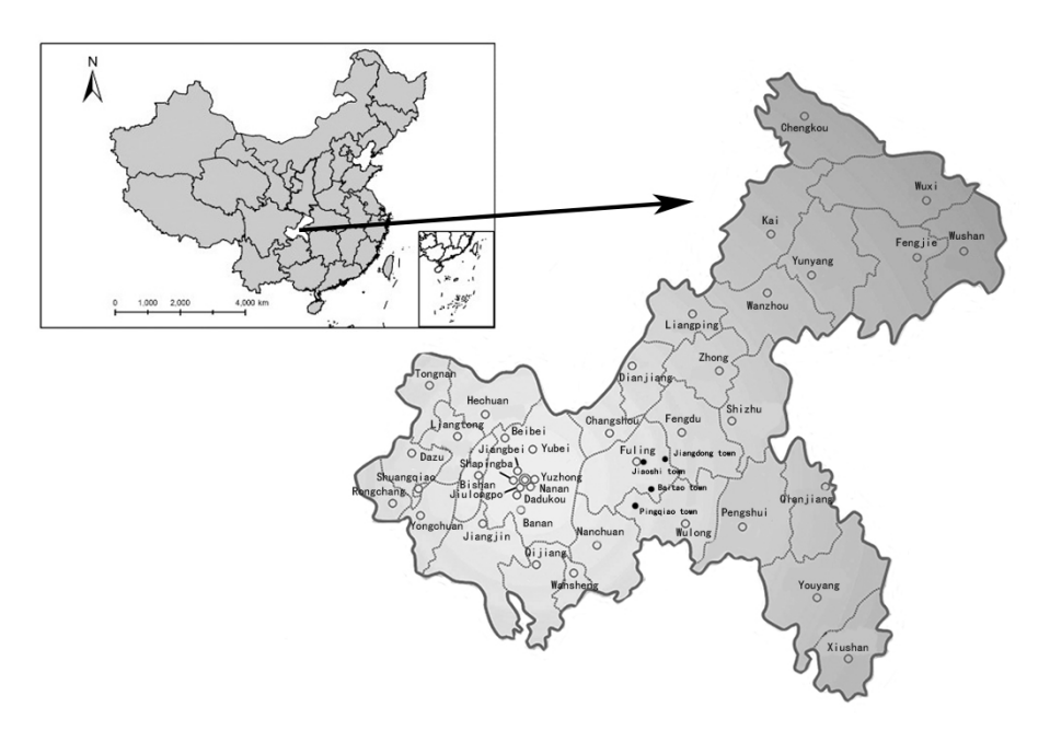
Figure 2. Map of the Chongqing Municipality and studied areas (labeled with •).

accomplish the goal of expanding FSGF's annual production capacity to 10 bcm by 2020 in two phases. The first-phase construction of 5-bcm production capacity was from 2013 to 2015, which encompassed 268.2 km<sup>2</sup> area with 194 bcm of proven reserves. The second-phase construction of 5-bcm production capacity, which encompassed a 291.4 km<sup>2</sup> area with 239 bcm of proven reserves, started in 2016 and is planned to end in 2020. At the end of 2018, Sinopec had drilled 402 wells in FSGF and produced about 60% of China's total shale gas output. In the future, Sinopec's Fuling project will continue to play a leading role in China's process of achieving its ambitious goal of producing 80 to 100 bcm of shale gas in 2030. Thus, our study will not only extend our understanding of the social acceptability in FSGF but also provide insights into residents' emotional responses in other SGE areas of China.