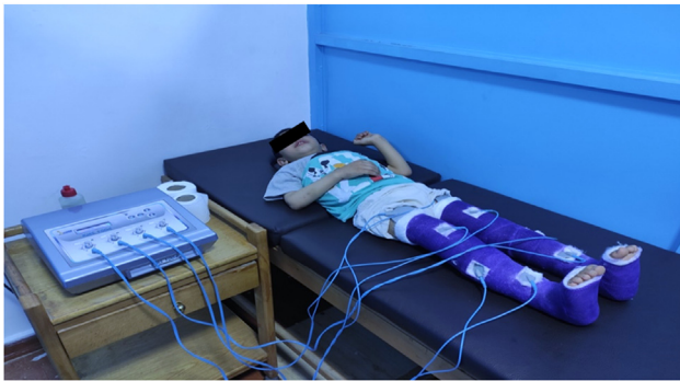
Figure 1: Application of the EMS1004 electrodes over the motor points of the knee extensors and ankle dorsiflexors.

ROM post-intervention versus pre-intervention in groups A ( P = 0.0001 and P = 0.0001 , respectively) and B ( P = 0.0001 and P = 0.0001 , respectively). The results also indicated significant decreases ( P < 0.05 ) in the right and left popliteal angle, gastrocnemius dynamic spasticity, and hamstring dynamic spasticity after versus before the intervention in group A ( P = 0.0001 , P = 0.0001 , and P = 0.0001 , respectively) and group B ( P = 0.0001 , P = 0.0001 , and P = 0.0001 , respectively). The right and left dorsiflexor strength significantly decreased ( P < 0.05 ) after the intervention in group A ( P = 0.0001 and P = 0.0001 , respectively), and non-significant differences ( P > 0.05 ) were observed in group B ( P = 0.435 and P = 0.356 , respectively). After the intervention, the mean values of right and left knee extensor strength significantly decreased ( P < 0.05 ) in group A ( P = 0.0001 and P = 0.0001 , respectively), and non-significant differences ( P > 0.05 ) were observed in group B ( P = 0.139 and P = 0.145 , respectively). The findings indicated significant increases ( P < 0.05 ) in the right and left observational gait scale scores after the intervention in groups A ( P = 0.0001 and P = 0.0001 , respectively) and B ( P = 0.0001 and P = 0.0001 , respectively).