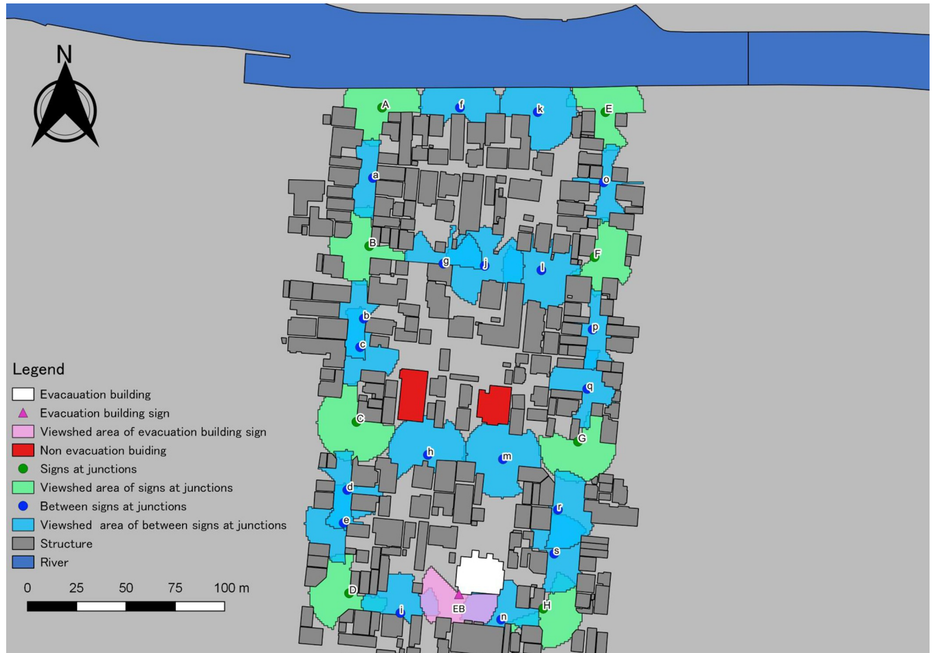
Fig 3. Visible area with tsunami evacuation guidance signs installed between the junctions. We obtained the map included this figure from the Geospatial Information Authority of Japan, a Japanese national organization [30]. According to the terms of use, the copyright holder does not need to apply for permission to use it when it is used for academic articles, and it can be used freely and commercially by following the CC BY 4.0 license [30].

https://doi.org/10.1371/journal.pone.0217512.g003