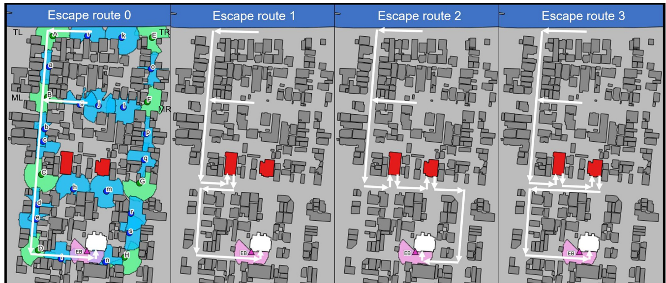
Fig 5. Possible escape routes to the tsunami evacuation building. White arrows indicate routes. For convenience of size, only the route on the left is displayed; however, the simulation was also conducted for the opposite side. TL (top and left): route to evacuate from the top to the left. TR (top and right): route to evacuate from the top to the right. ML (middle and left): route to evacuate from the middle to the left. MR (middle and right): route to evacuate from the middle to the right. Escape route 0: when tsunami evacuation guidance signs are installed without interruption. Escape route 1: escape via the nearest non-tsunami evacuation building; as in the real-world situation, signs are set up only for the tsunami evacuation building. Escape route 2: when returning to the original route by way of the two non-tsunami evacuation buildings; as in the real-world situation, signs are set up only for the tsunami evacuation building. Escape route 3: returning to the original route via the two non-tsunami evacuation buildings; as in the real-world situation, signs are set up only for the tsunami evacuation building. We obtained this figure from the Geospatial Information Authority of Japan, a Japanese national organization [30]. According to the terms of use, the copyright holder does not need to apply for permission to use it when it is used for academic articles, and it can be used freely and commercially by following the CC BY 4.0 license [30].

https://doi.org/10.1371/journal.pone.0217512.g005