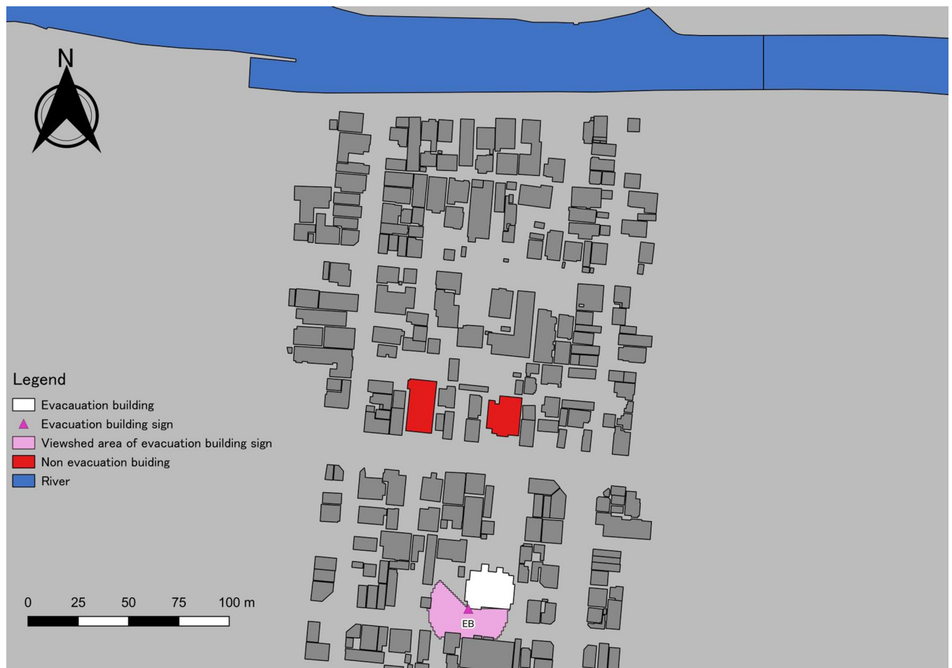
Fig 2. Area around our targeted tsunami evacuation building. We obtained the map included this figure from the Geospatial Information Authority of Japan, a Japanese national organization [30]. According to the terms of use, the copyright holder does not need to apply for permission to use it when it is used for academic articles, and it can be used freely and commercially by following the CC BY 4.0 license [30].

With viewshed analysis and the signs installed at eight junctions, we found that the visible area with the signs increased to an average of 710.5 m 2 ; that raised the proportion to the maximum area to an average of 56.6%. The distances between the signs on the junctions were 70 m or more; the visibility of the signs was not continuous. To effectively cover the route to the