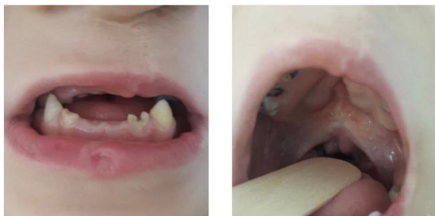
Figure 1: Establishing the existence of cleft lip and palate

Class IV – The cleft is bilateral cleft lip and palate.