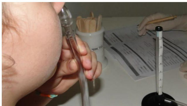
Figure 2: Measuring nasal air emission using the See-Scape instrument

The See-Scape instrument is used for instrumental examination [15] of nasal air emission in speech. The examination is indirect, non-invasive and simple to conduct. In addition to the clear visual representation, the instrument gives the opportunity to objectively measure the nasal air emission of the patient during the speech. Measuring nasal air emission using the See-Scape instrument (Figure 2) begins by inserting the nasal tip in one of the patient's nostrils.