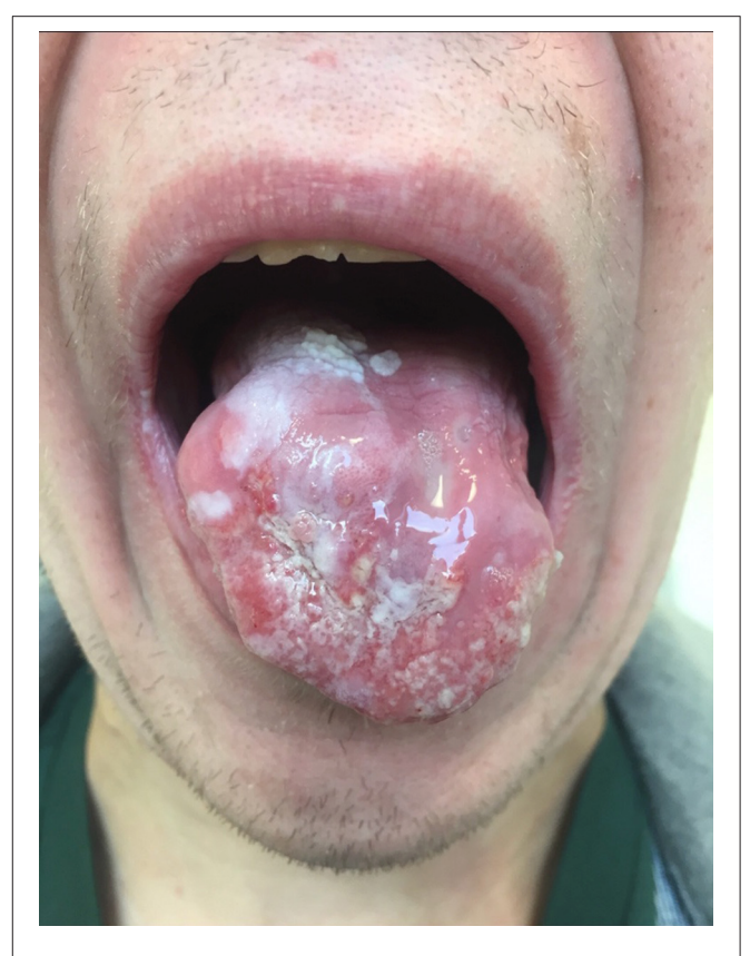
FIGURE 2 | A picture of the tongue of patient #3 at time of diagnosis. The patient presented with severe CMC, glossitis, and severe pain in the tongue. Extensive, non-homogenous changes in the form of speckled leucoplakia were observed covering the whole dorsal side of the tongue which was sensitive and indurated at palpation and functionally compromised with limited movements.

At the age of 21 years he developed severe glossitis and pain in the tongue ( Figure 2 ). A constantly elevated lymphocyte count in peripheral blood was also present. Initial biopsy revealed stromal inflammation and hyperkeratosis without signs of malignancy. However, the pain continued and, 2 months later, new biopsies showed areas with epithelial hyperplasia, hyperkeratosis ( Figure 3A ), and stromal inflammation dominated of plasma cells ( Figure 3B ), and invasive SCC with a various histologic appearance from well ( Figure 3C ) to poorly differentiated lesions